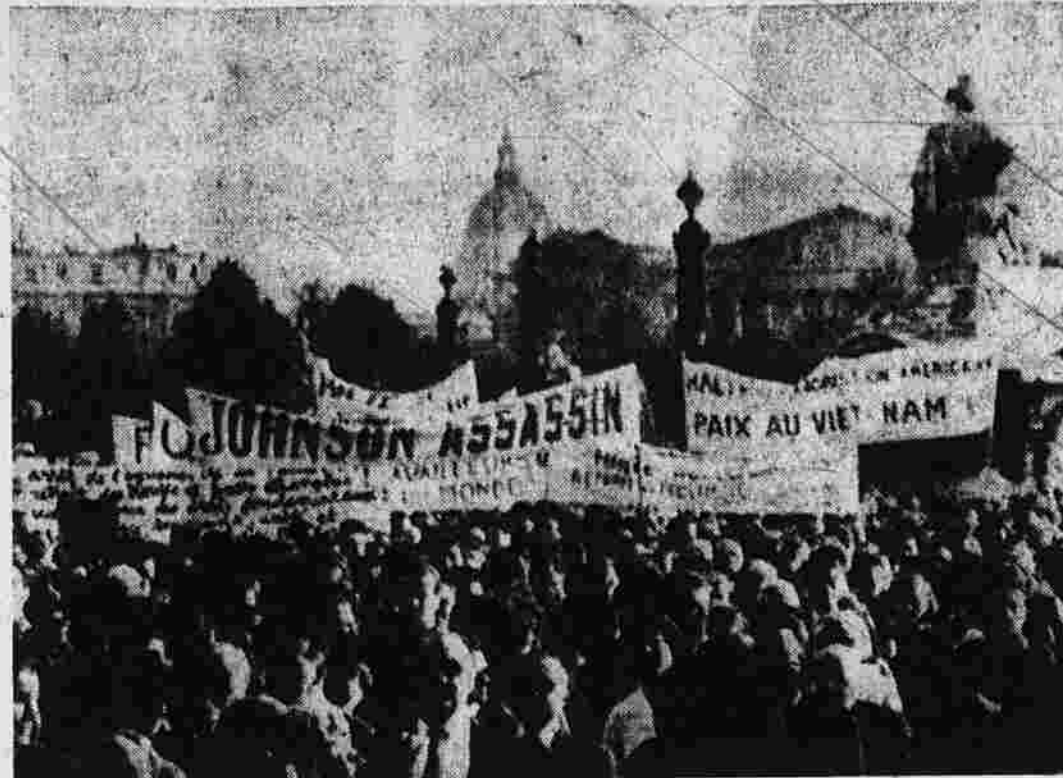
French Communist rally brought out these demonstrators near the U.S. embassy in Paris. They bore signs protesting the U.S. bombing of fuel depots near Hanoi and calling for Viet Nam peace.